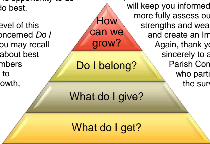
The Parish Engagement Pyramid

The Leadership Team will now take some time to analyze the results of our very first parish engagement and spiritual commitment survey. We will keep you informed as we more fully assess our Parish strengths and weaknesses and create an Impact Plan. Again, thank you sincerely to all in our Parish Community who participated in the survey.